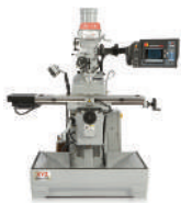
2 off XYZ SMX 2000