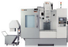
3 off XYZ 1060