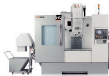
XYZ 1060 mk2