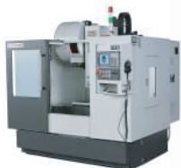
XYZ VMC 710