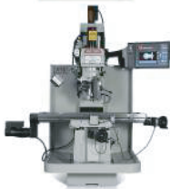
XYZ SMX 2500