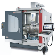
XYZ UMC-5X 5 axis